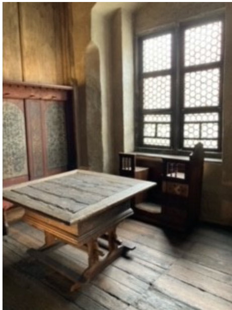
Table Talk Room

University students wanted to stay at 'Lutherhaus' because often in the evening, Luther would teach and dialogue with the students while they diligently took notes. These were called 'Table Talks' and there are thousands of written entries in books from these talks. The room that the Table Talks usually took place is still original. You can see the table. The chair in the back ground is where Katharina would often sit, sometimes with a child or two. The University students didn't always appreciate her presence but that didn't stop her. Most of 'Lutherhaus' is now a very interesting museum.