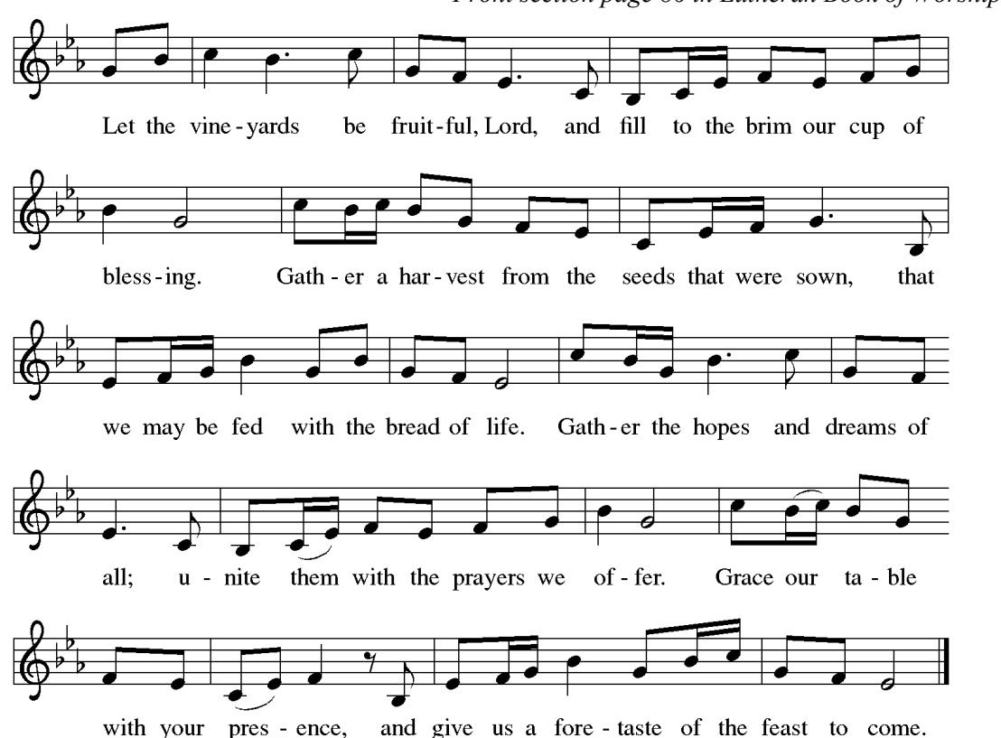
Augsburg Fortress copyright under Sundays and Seasons

Front section page 86 in Lutheran Book of Worship