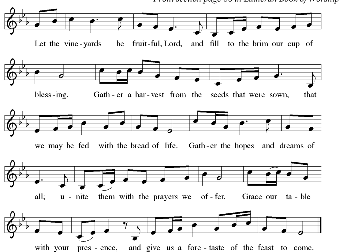
Augsburg Fortress copyright under Sundays and Seasons

Front section page 86 in Lutheran Book of Worship