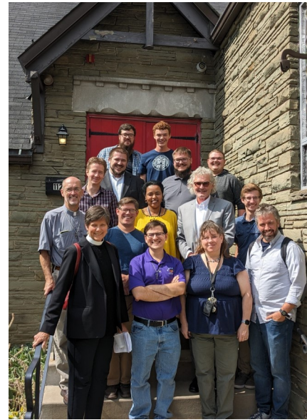
Seminary students at NALS North American Lutheran Seminary

St. Timothy's Lutheran Church 5100 Camden Street San Jose, CA 95124 ***Please note on the memo line: CPMD SCHOLARSHIP FUND