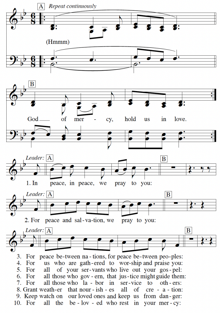
Text and Music: Marty Haugen, b. 1950; © 1990, GIA Publications, Inc.